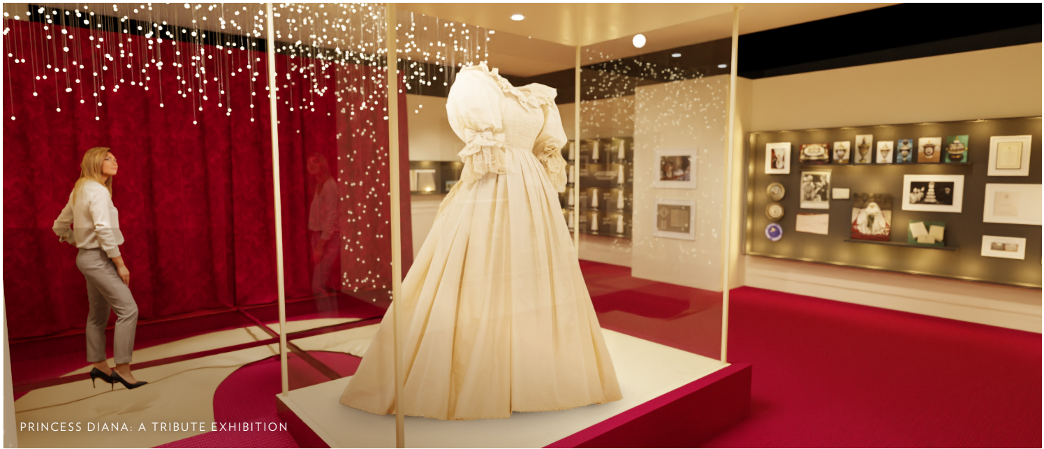
PRINCESS DIANA: A TRIBUTE EXHIBITION