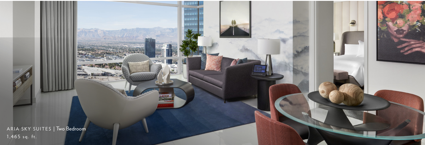
ARIA SKY SUITES | Two Bedroom 1,465 sq. ft.