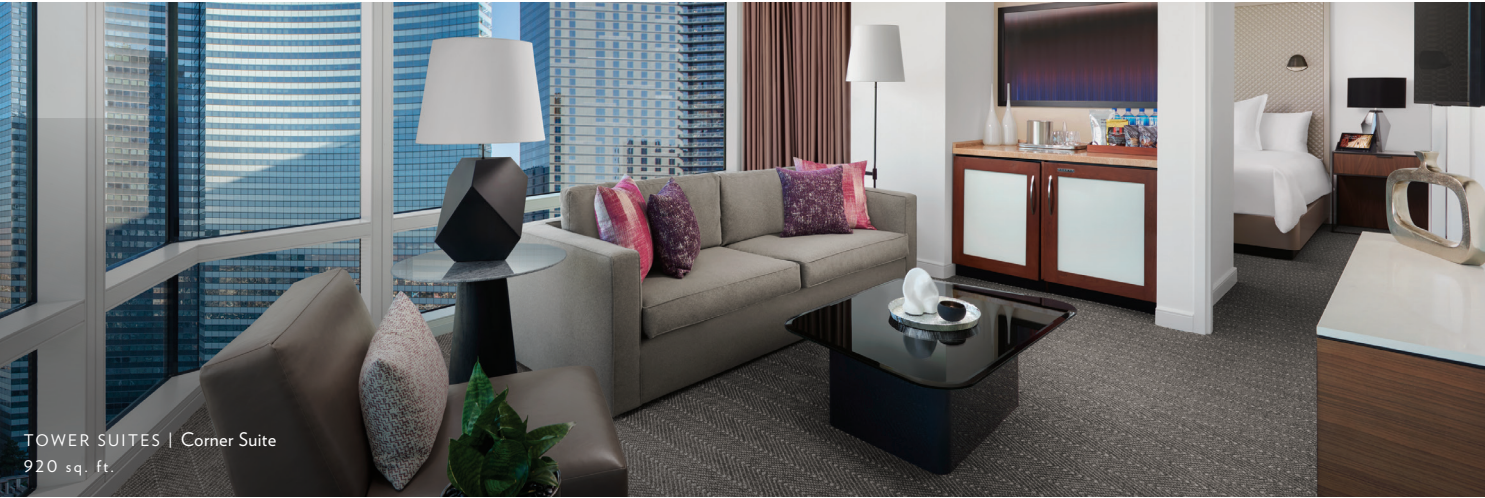
TOWER SUITES | Corner Suite 920 sq. ft.