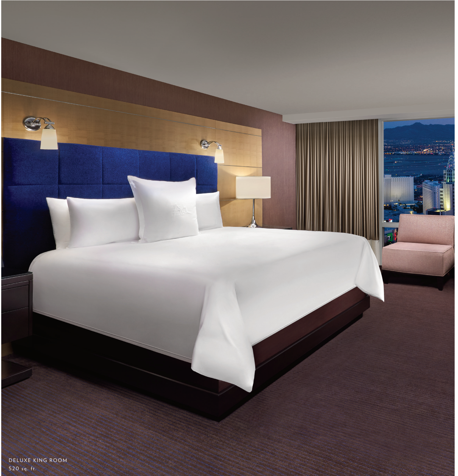
DELUXE KING ROOM 520 sq. ft.

The interior spaces are just as innovative as the exterior architecture. After the curtains part upon entry, one can set preferences for lighting, temperature or a favorite morning show for meeting the new day.