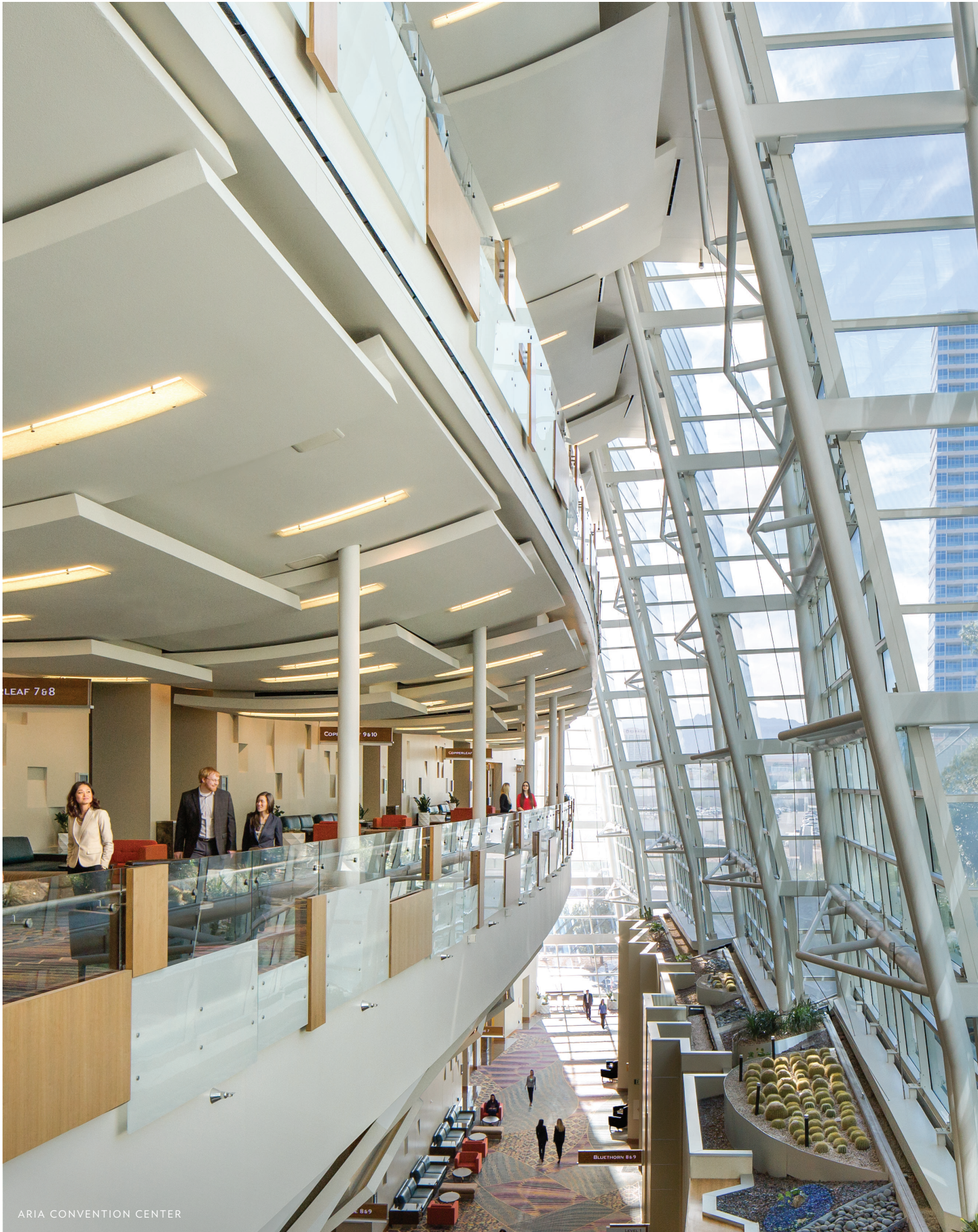
ARIA CONVENTION CENTER