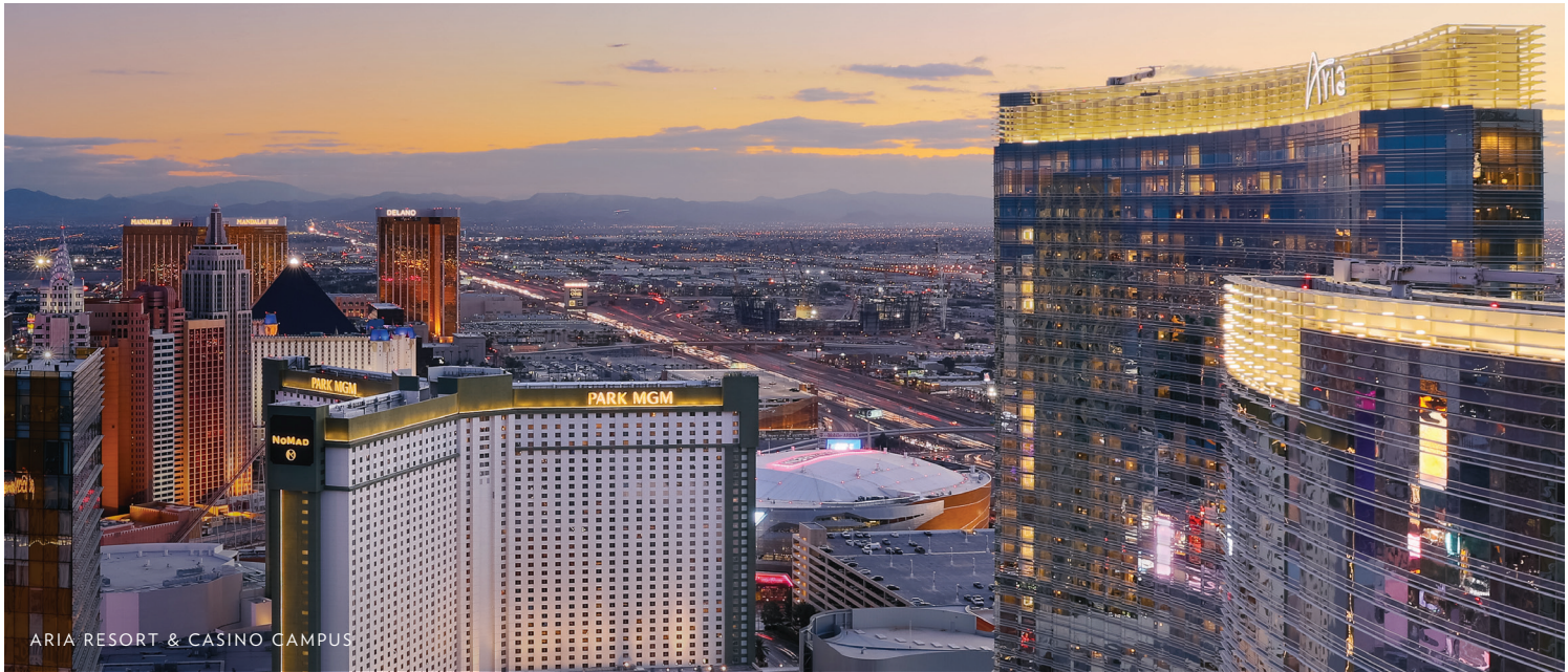
ARIA RESORT & CASINO CAMPUS