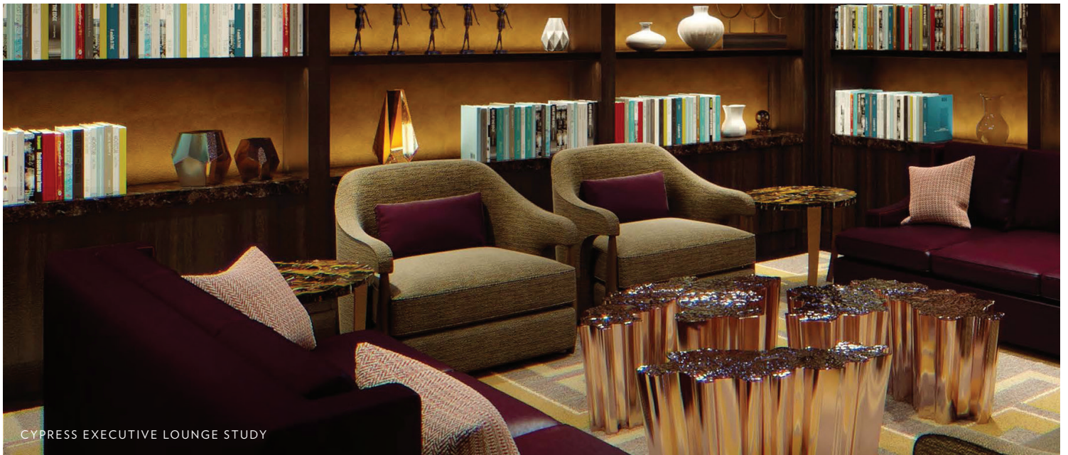
CYPRESS EXECUTIVE LOUNGE STUDY