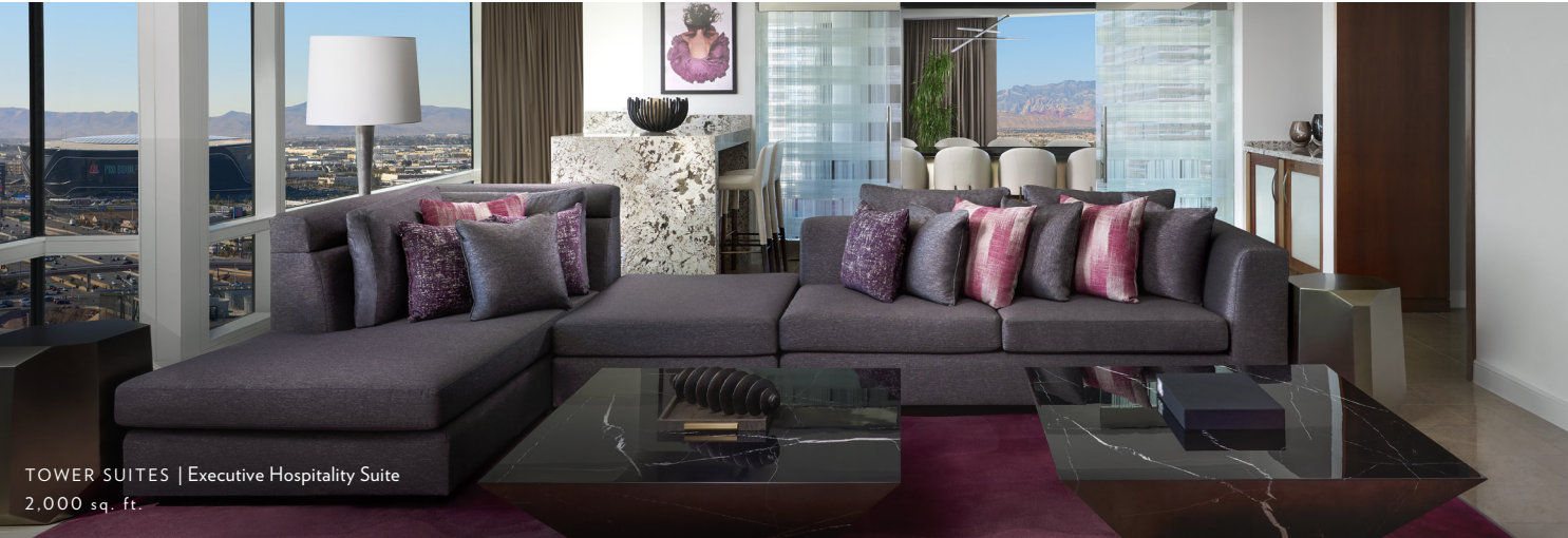
TOWER SUITES | Executive Hospitality Suite 2,000 sq. ft.

ARIA's suites offer experiences to satisfy a variety of needs, such as separate parlors and bedrooms in Corner Suites or large parlors for entertaining and separate conference rooms in Executive Hospitality Suites. For VIP requests, the ARIA Sky Suites offer the ultimate in luxury with complimentary limousine airport transportation, a separate entrance to a personalized check-in experience, a lobby lounge and private elevators.