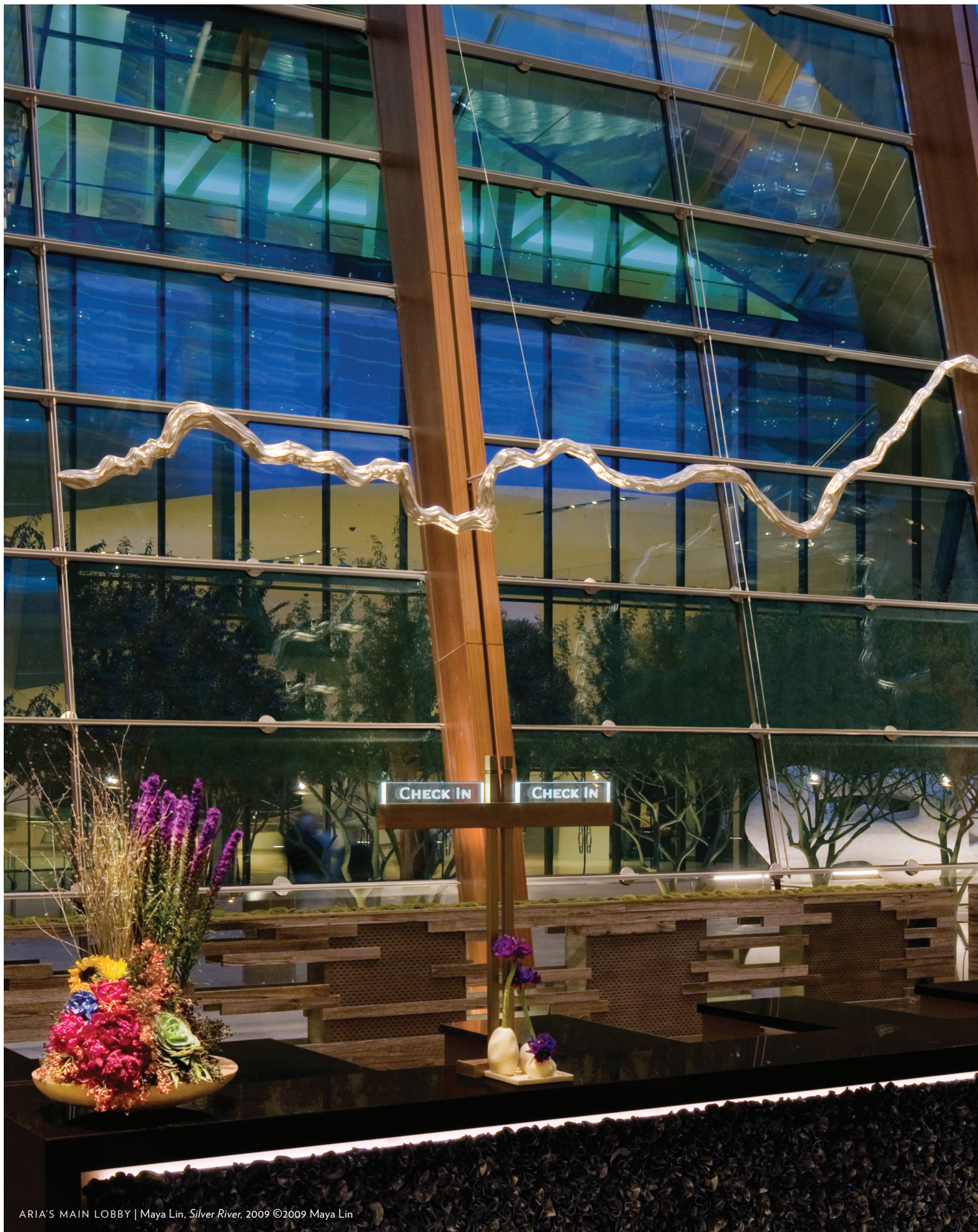
ARIA'S MAIN LOBBY | Maya Lin, Silver River , 2009 ©2009 Maya Lin