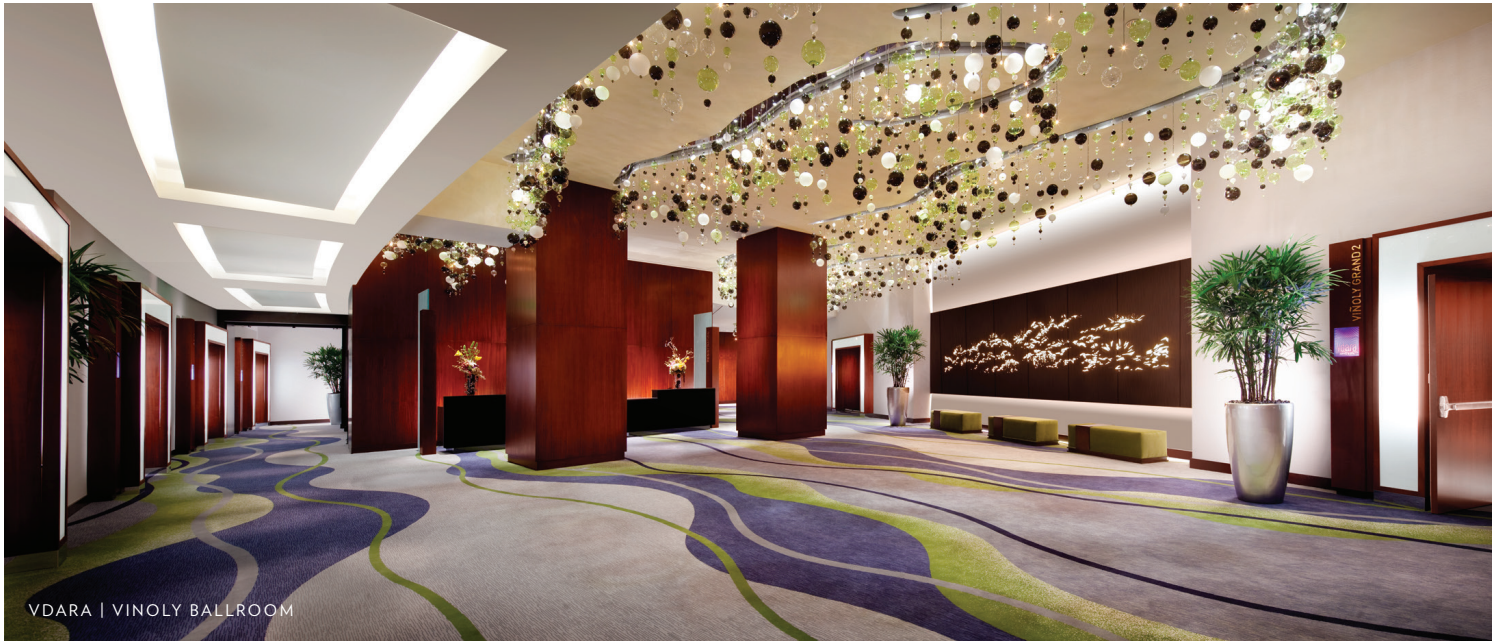
VDARA | VINOLY BALLROOM